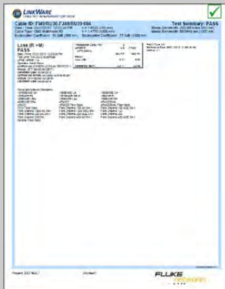
Encircled Flux and Test Reference Cords Tested